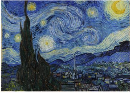
Starry Night by Van Gogh