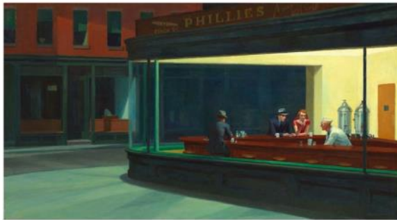
Edward Hopper, "Nighthawks" (1942)