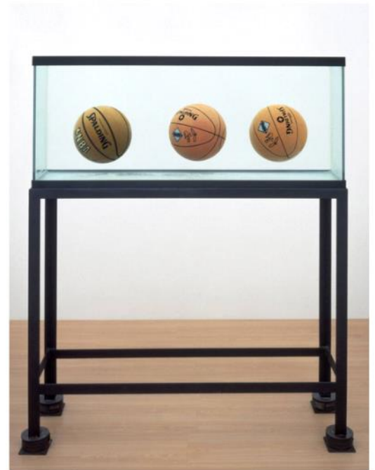
Jeff Koons Three Ball Total Equilibrium Tank (Two Or J Silver Series, Spalding NBA Tip-Off) 1985 Tate © Jeff Koons