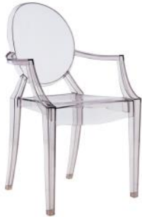
Louis Ghost Chair for Kartell Polycarbonate, $450, or knock-off for $99.

Through his "democratic design" concept, Starck campaigns for well-designed, quality objects that are not just reserved for an elite. He would put this utopian idea [16] into practice by increasing production quantities to cut costs and by using mail-order, via Les 3 Suisses .