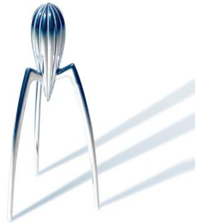
juicy salif for Alessi $85

But is maybe more famous for other projects: Steve Jobs' yacht, finished just after Jobs' death