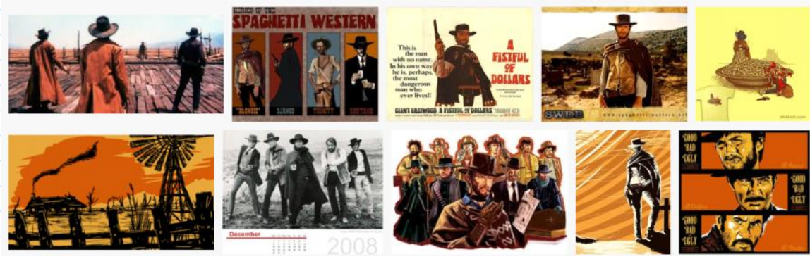
Good bad and ugly on Itunes store