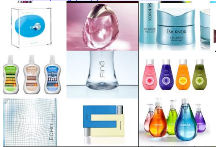
Anthropomorphic principle, eh?

described (by Rashid himself) as "sensual minimalism" and " bobjects ". From < https://en.wikipedia.org/w/index.php?title=Karim_Rashid&oldid=704748263 >