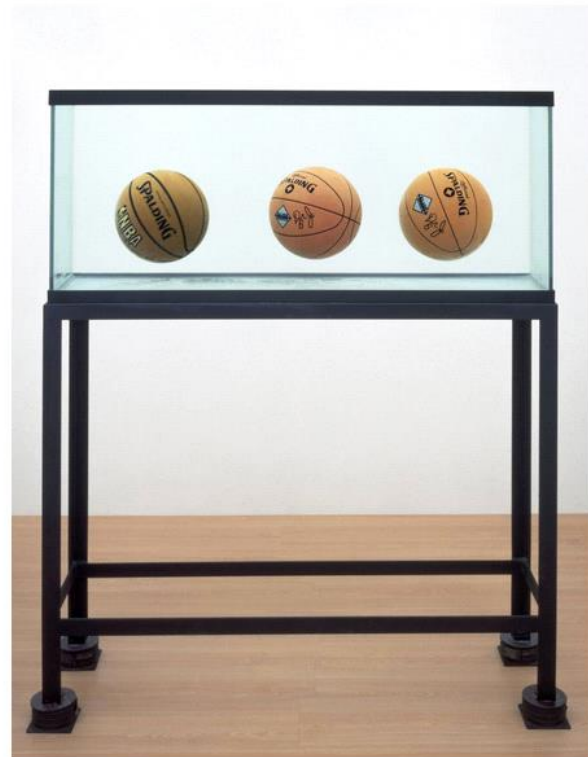
Jeff Koons Three Ball Total Equilibrium Tank (Two Dr J Silver Series, Spalding NBA Tip-Off) 1985 Tate