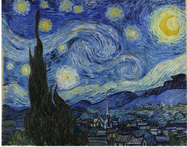
Starry Night by Van Gogh