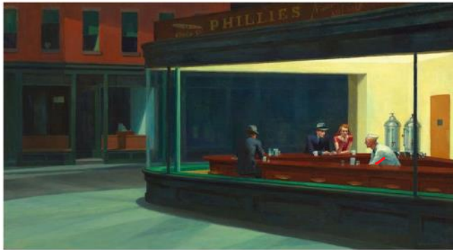
Edward Hopper, "Nighthawks" (1942)