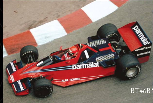
BT46B “Fan Car”