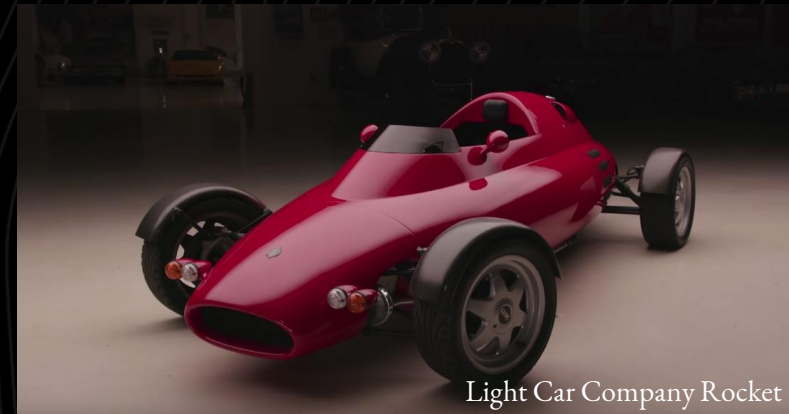
Light Car Company Rocket