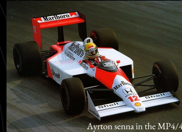
Ayrton senna in the MP4/4