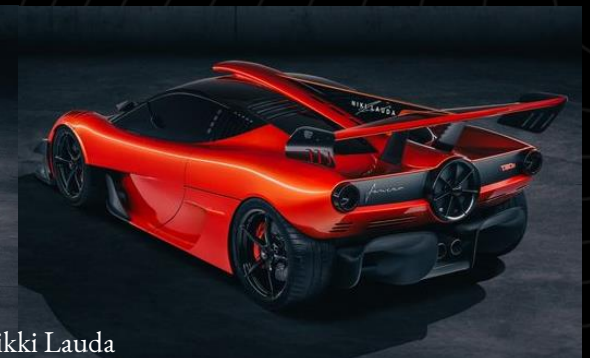
T50s Nikki Lauda